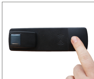
Press LED button