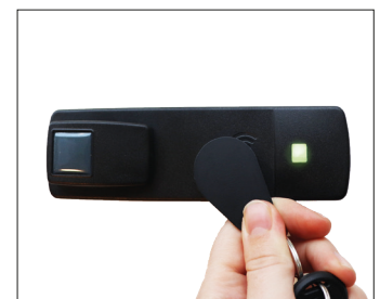
Scan tag on reader