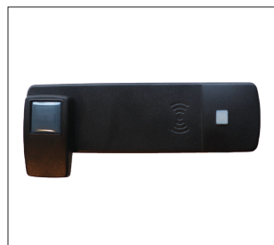
Locker lock open