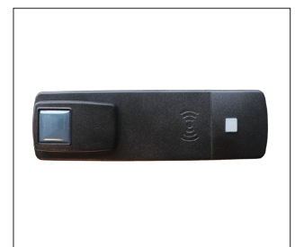
Locker lock closed